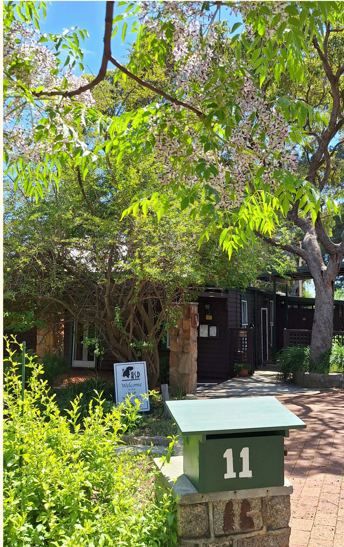
Front of the house