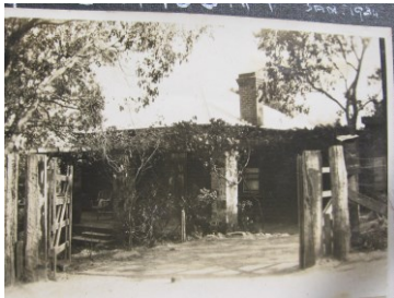
Katharine's Place, circa 1920s

Katharine's Place retained its 1919 original form with minor additions to the grounds, such as a large summerhouse, until it became Megalong Gallery in the 1970s. Then the two central rooms and passage were made into one large room, and the northern veranda was replaced by a large living room (now the meeting room) and extra bedroom. The property as it is now is only half of what it used to be, as Katharine sold off the extra lot before she died.