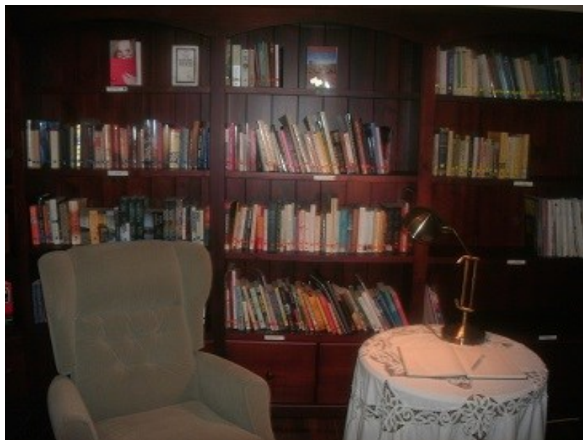
KSP member library and reading room Open during office hours and events